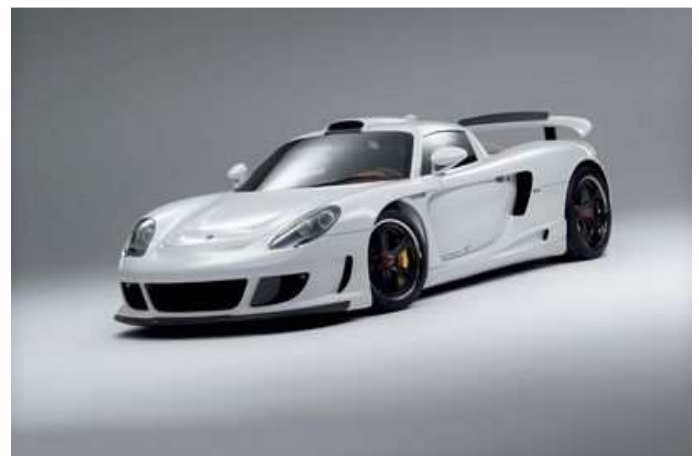
Not your daddy's Carrera GT